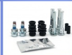
Brake Repair Kit