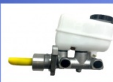
Brake Master Cylinder