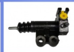
Brake Slave Cylinder