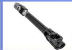
Steering Column Shaft