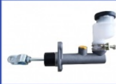
Clutch Master Cylinder