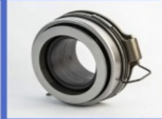
Clutch Release Bearing