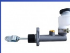
Clutch Master Cylinder