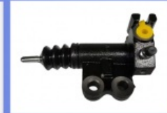
Brake Slave Cylinder