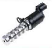
Oil Control Valve