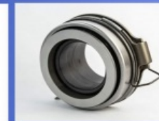
Clutch Release Bearing