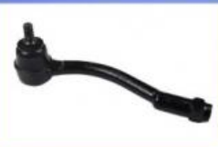
Tie Rod End