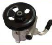
Power Steering Pump