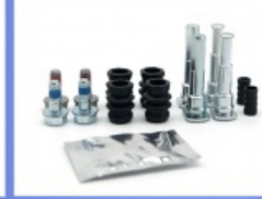
Brake Repair Kit