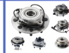
Wheel Hub Bearing