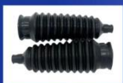
Steering Gear Boots